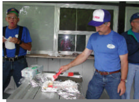
Knife! We don't need no stinking knife!!

and if it did if anyone would come to the show. There was one brave soul who brought his new model Mustang. It was a beautiful car and we were all sorry that the weather was so lousy.