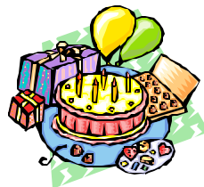
Happy Birthday to you!!