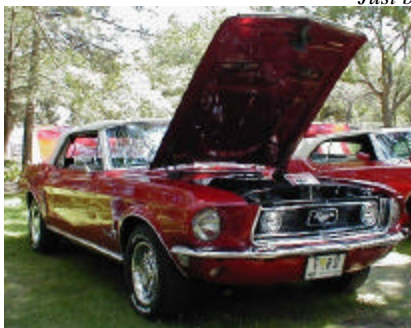
I never was any good at telling twins apart—can you??