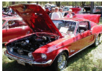
The Rupp made history with this show—no incidents!