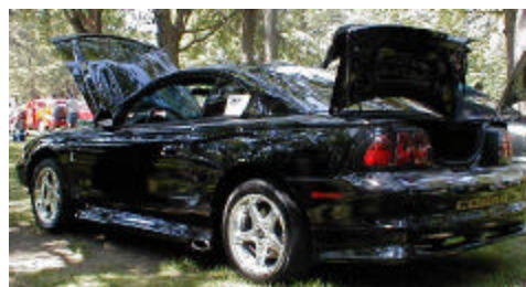
Just be glad all State Troopers don't drive these!