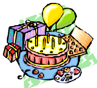
Happy Birthday to

Take a moment to wish a happy birthday to these great CCFMC members: