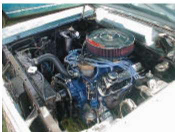
Quite a "Wiley" looking engine!!