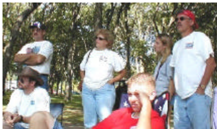
The anticipation of trophy-time!