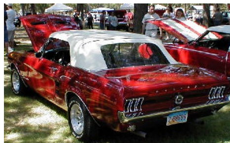
Trivia Question: How do YOU spell Rose crans??