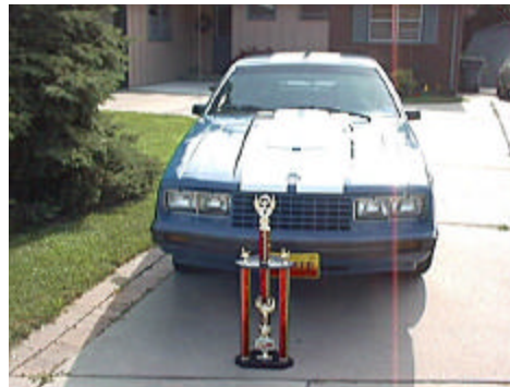
See? Taking the underwear off the seat really pays off!!