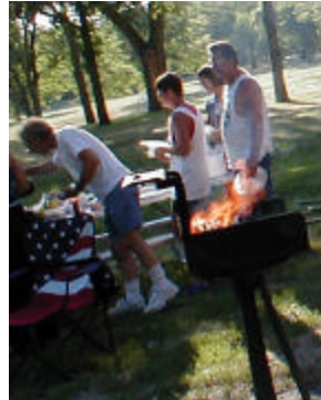
Food, fun, friends!