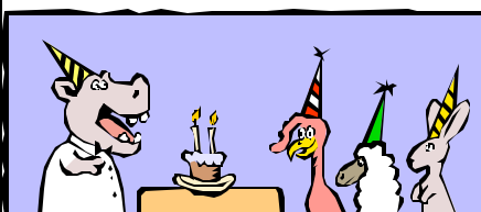
Happy Birthday to you!!