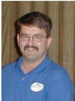
Do you know this man?

I am very honored to have been elected the new club President. I suppose most of you know me fairly well by now but there are a bunch of new folks that I haven't gotten to know very well yet.