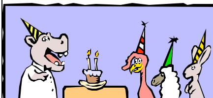
Happy Birthday to you!!